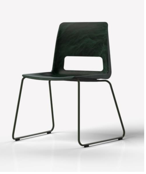
The S-1500 chair references the textures, colors and crafts of it's origin in the North of Norway. The chair-shell is made from 100% recycled plastic from the fish farming industry in the north of Norway, and the chair's subframe is obtained by partially recycled Norwegian steel. The chair is a redesign of Bendt Winge's classic R-48 chair. Also prodused by NCP.